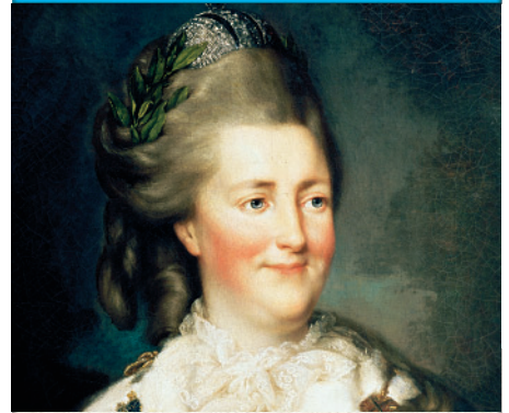
Catherine the Great 1729–1796

The daughter of a minor German prince, Catherine was 15 when she was handed over to marry the Grand Duke Peter, heir to the Russian throne.